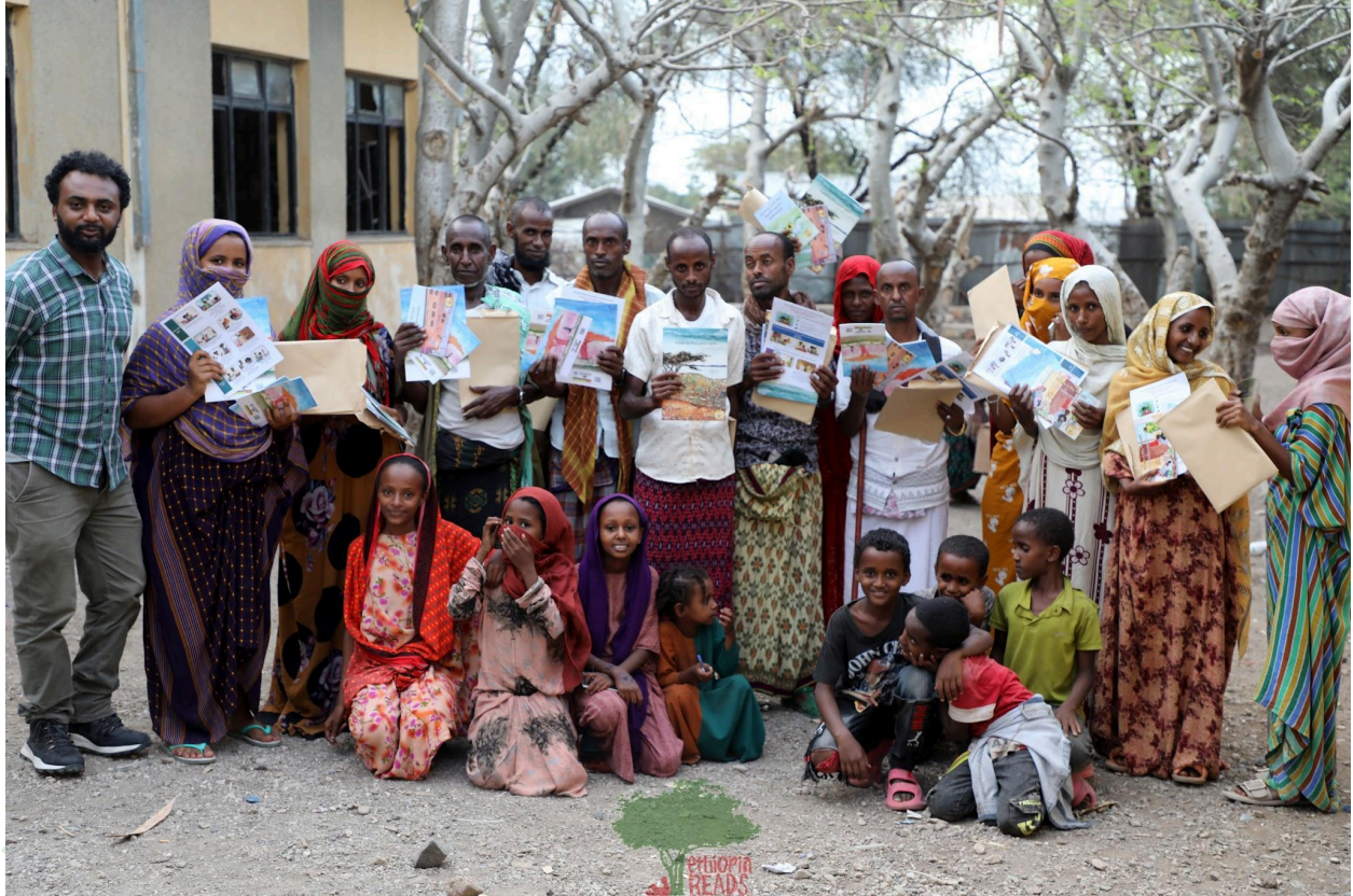
Our staff at the end of a successful training and book distribution in Afar Region, 2024

*Open Hearts Big Dreams, one of our collaborating organizations, worked with the Ethiopia Reads team to prepare the OHBD-RSG bilingual books Ethiopia Reads distributed to IDP families. More info at ohbd-rsgbooks.com .