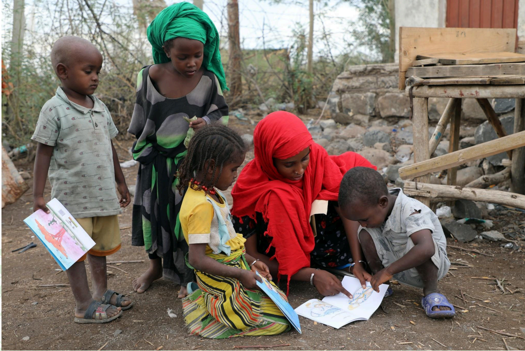
Children with SDAD Project books in Afar Region, 2024