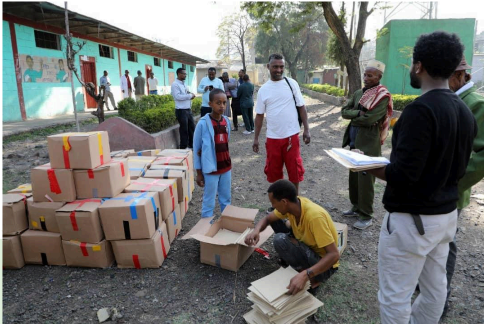
Ethiopia Reads' staff distributing SDAD books in Amhara Region, 2024

This year Ethiopia Reads expects to expand our work to print and distribute another 100,000 books* and provide training to other difficult-to-reach areas in Ethiopia. Instead of providing books directly to individuals, we will be creating book banks in communities that have had schools destroyed or damaged.