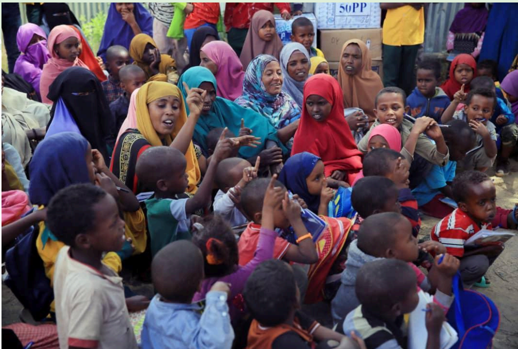
Parents and children at an ER book distribution pilot project in Somali Region, 2021

Ethiopia Reads' work has been primarily focused on our long-term strategic goals of supporting children's reading by providing libraries, books and associated training across the country. However, given the scale of the impacts, we decided to try to help alleviate this escalating educational crisis for millions of children who no longer have access to schools or books. Our Ethiopian staff, in particular, pushed the organization to explore what we could do for the affected populations.