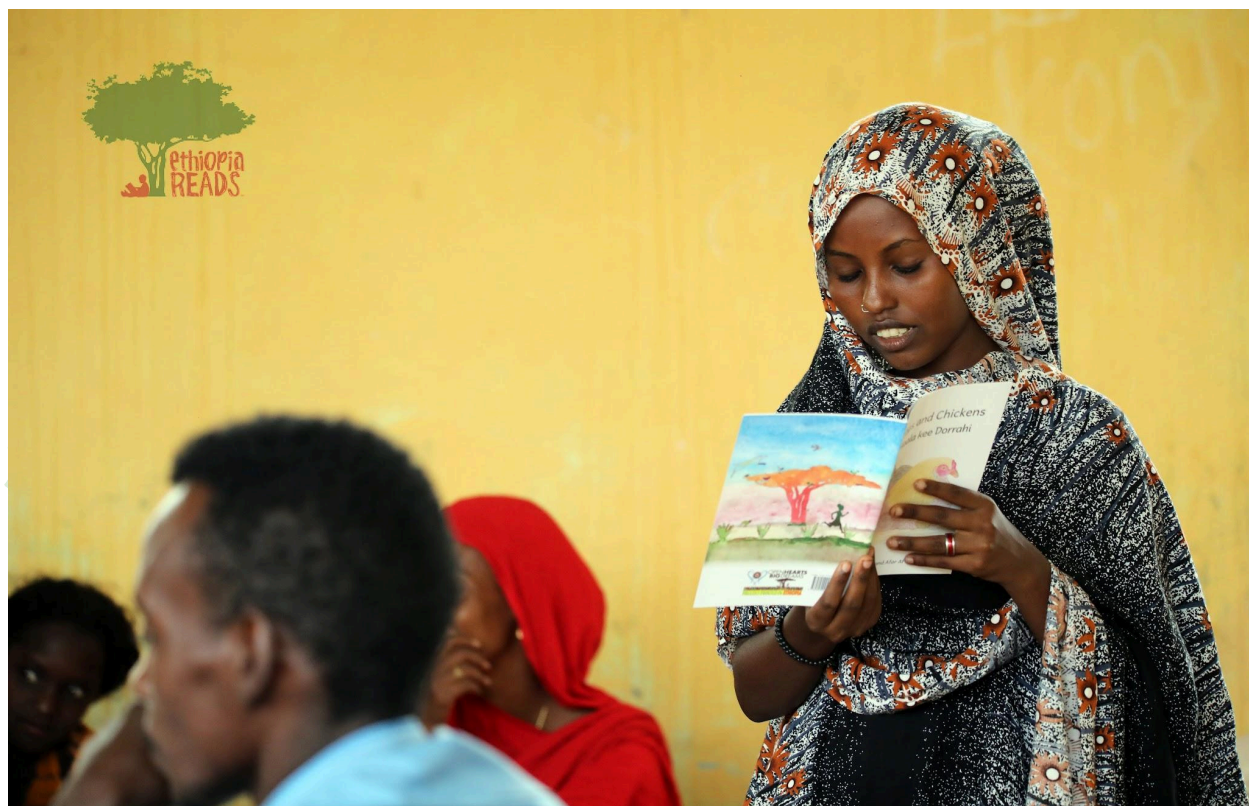
Training caregivers in Afar Region, 2024

Like the two previous projects (Read-At-Home and SDAD), we plan to train educators and caregivers on supporting children’s reading. We are planning and applying our knowledge and know-how from the previous two projects to effectively implement the project in sensitive areas in the country. We expect this Book Bank project to be completed by the end of 2024 and will distribute a total of 200,000 to 250,000 books.