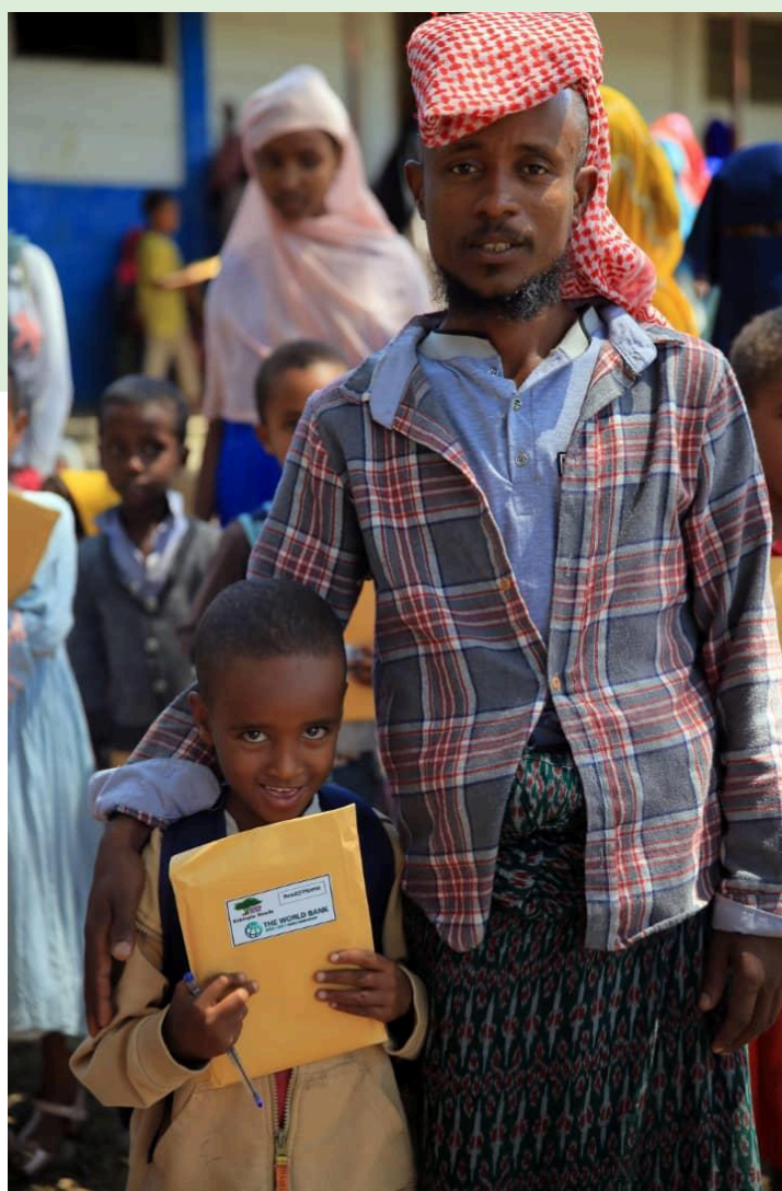
Families receiving Read-At-Home book distribution in Oromia Region, 2021

In 2021, Ethiopia Reads took up the enormous task of getting books and training to many of the children affected by conflict with no education available, whether internally displaced persons, in conflict-affected communities without schools or in communities where schools had been damaged by conflict.