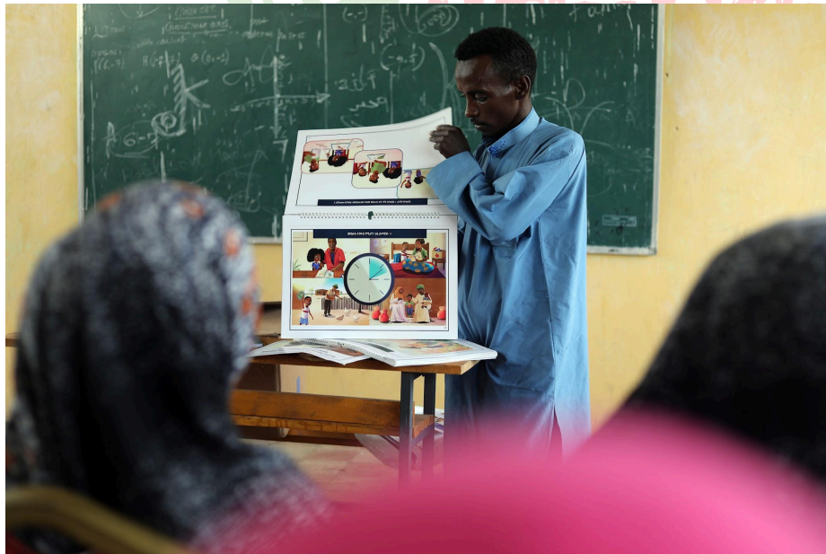
SDAD Training of Key Leaders in Afar Region, 2024

This year Ethiopia Reads expects to expand our work to print and distribute another 100,000 books* and provide training to other difficult-to-reach areas in Ethiopia. Instead of providing books directly to individuals, we will be creating book banks in communities that have had schools destroyed or damaged.